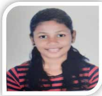
Bhargvee Dilip Bhatade - Painting